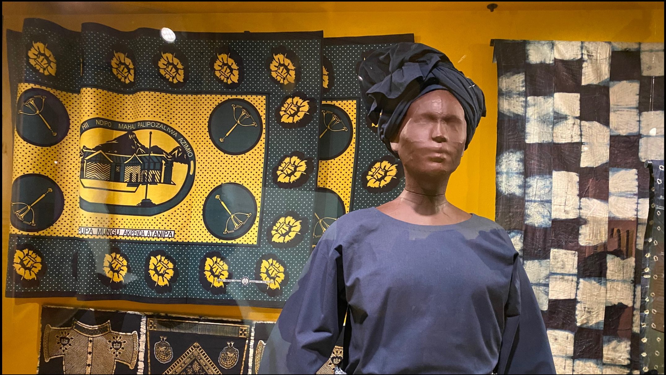
Africa Fashion, V&A, July 2022-April 2023, installation shot