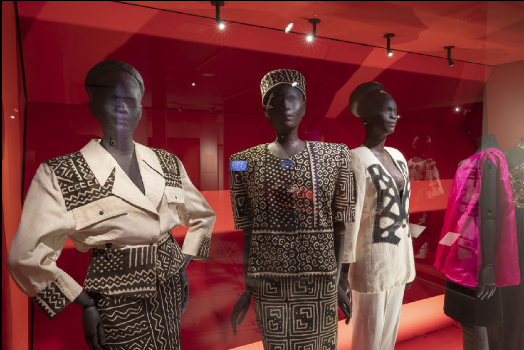
Africa Fashion, V&A, July 2022-April 2023, installation shot