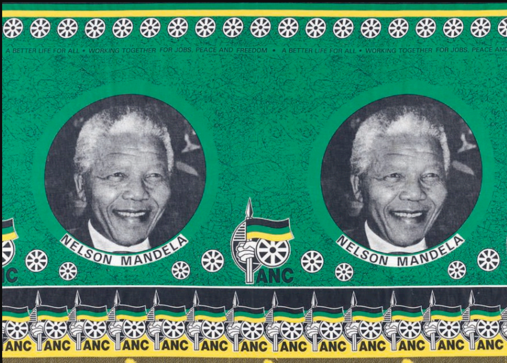
Nkosi Traditional Fabrics CC ANC Nelson Mandela commemorative cloth, printed cotton Akasia, South Africa, 1991 V&A: T.2418-2021