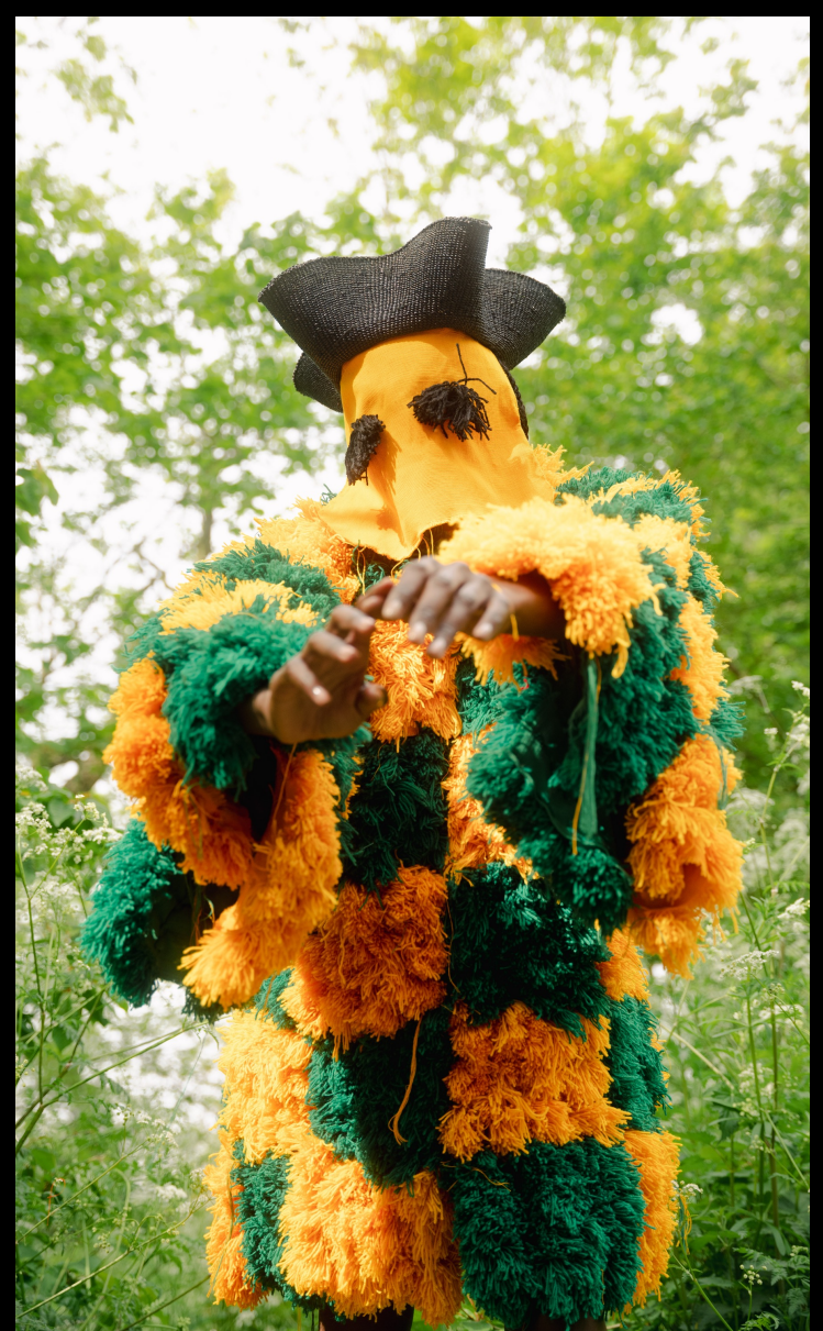
Bubu Ogisi, IAMISIGO, 'I Am Not Myself', the Tetley, 2022