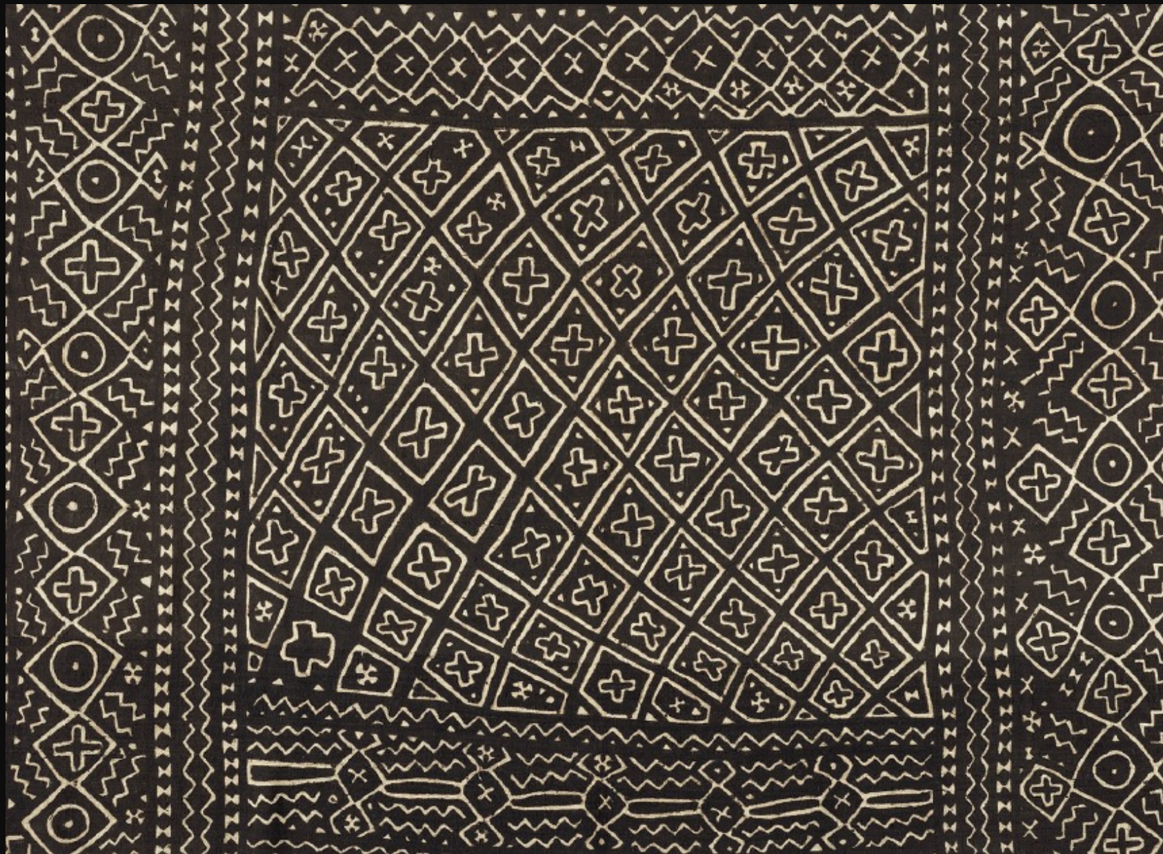
Detail of Bògòlanfi ni wrapper, cotton, natural dye Mali, probably Bamana, c.1960 V&A: CIRC.497–1968