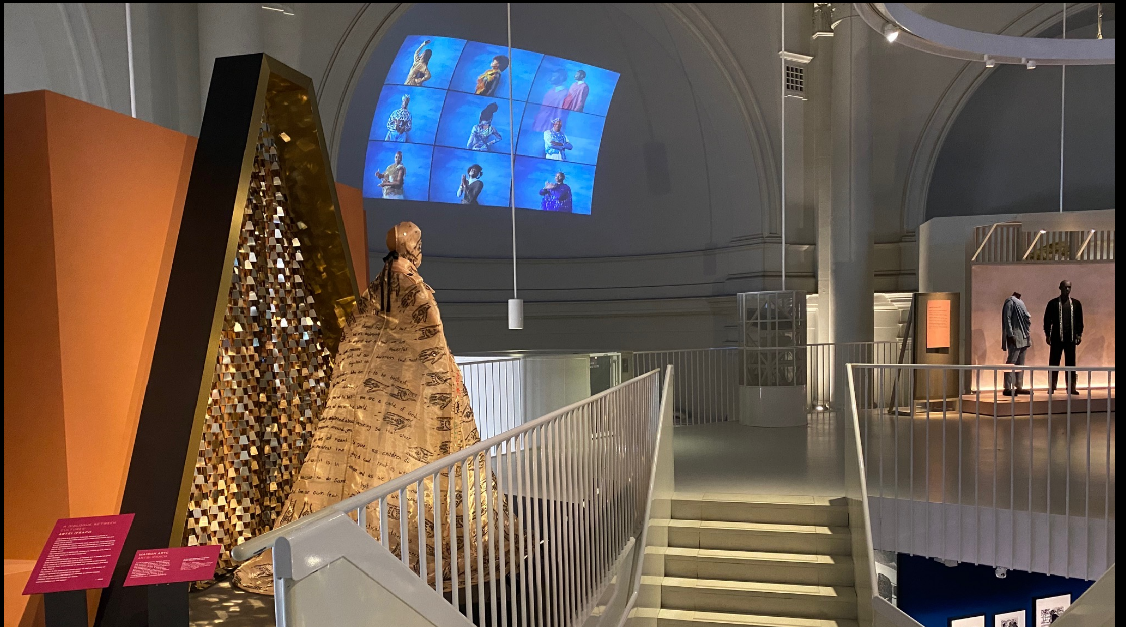
Africa Fashion, V&A, July 2022-April 2023, installation shot