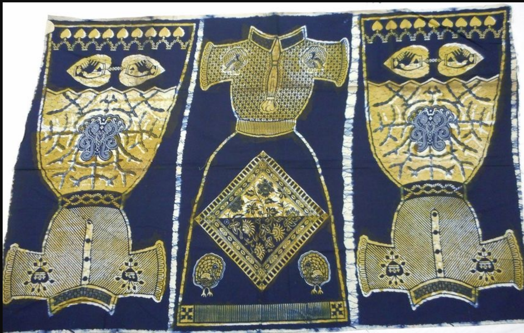
Brown Fleming Ltd (merchant) Printed cloth, cotton Netherlands/Great Britain/ Switzerland, designed 1909 V&A: T.167-2004