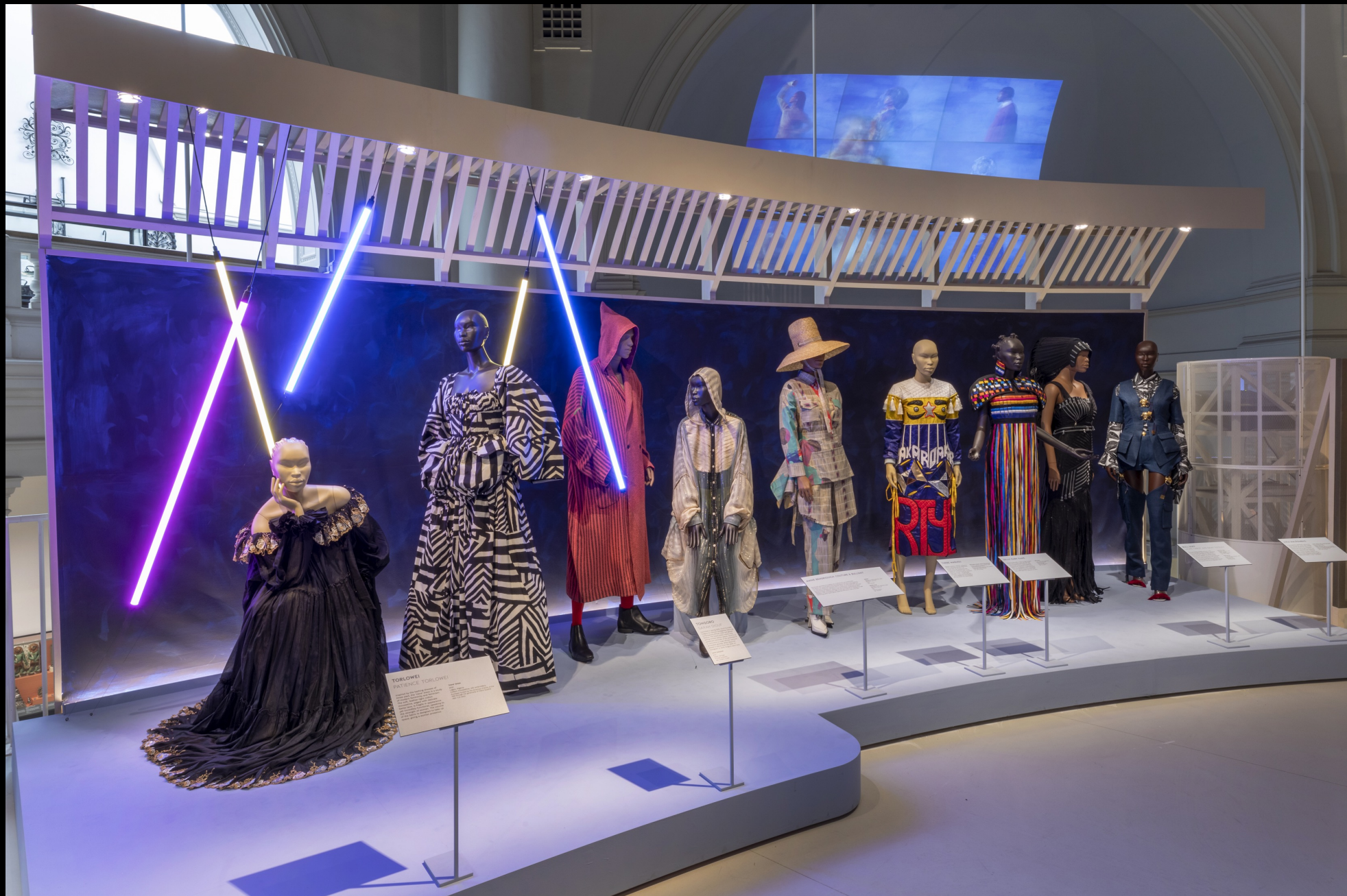
Africa Fashion, V&A, July 2022-April 2023, installation shot