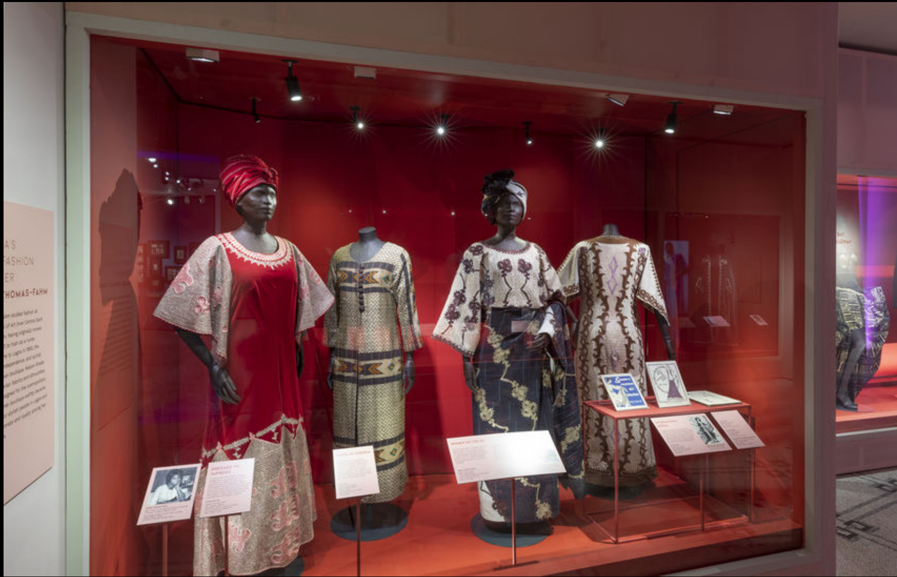
Africa Fashion, V&A, July 2022-April 2023, installation shot