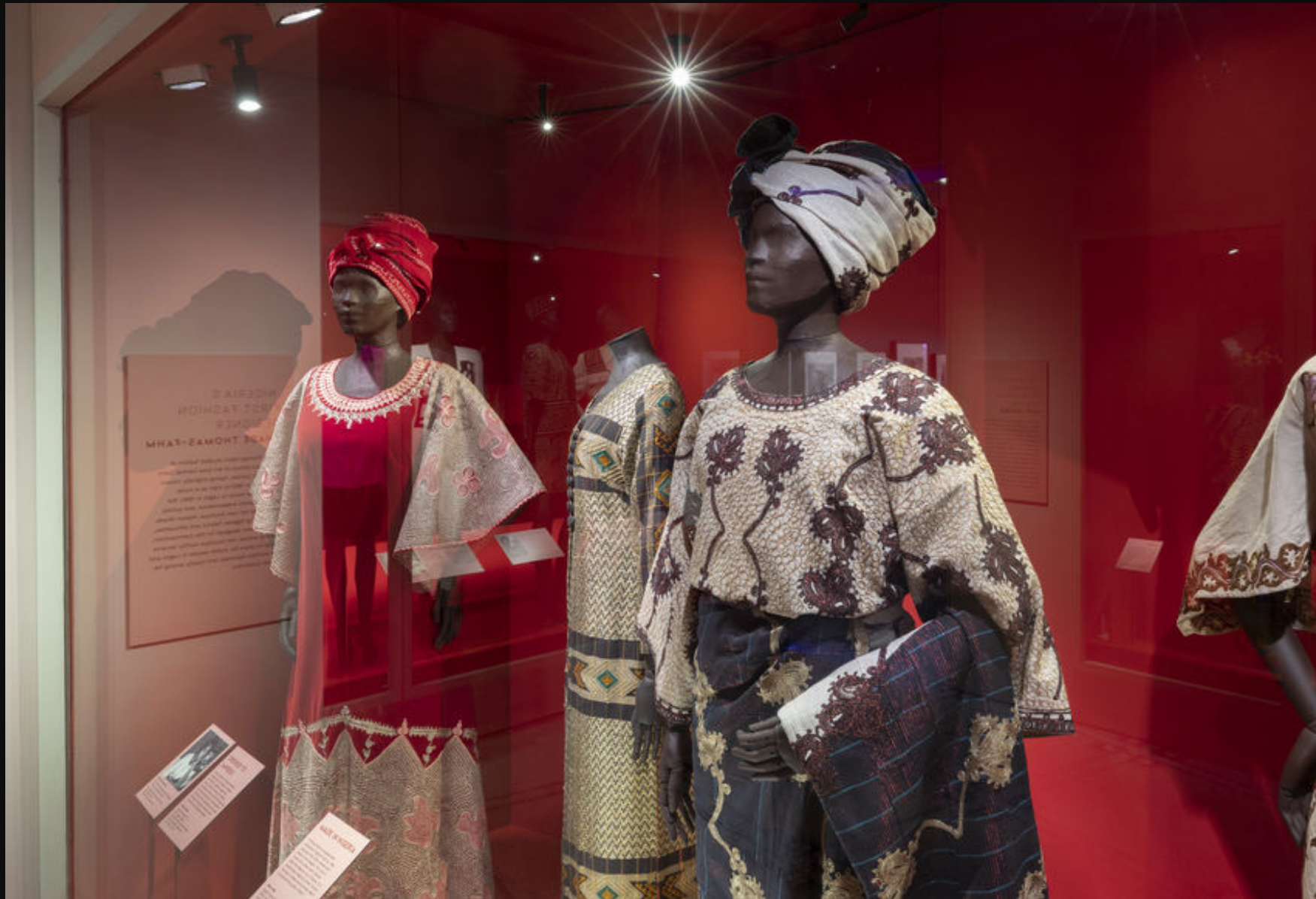
Shade Thomas Fahm Africa Fashion , V&A, July 2022-April 2023, installation shot