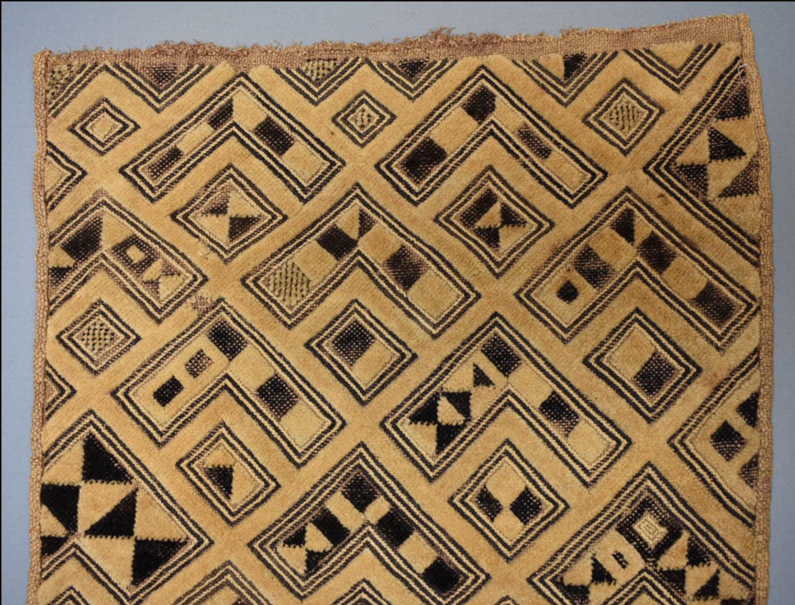
Kuba cloth Fragment of embroidered raffia, made in Congo, 1900- 1949 V&A: T.134-1985