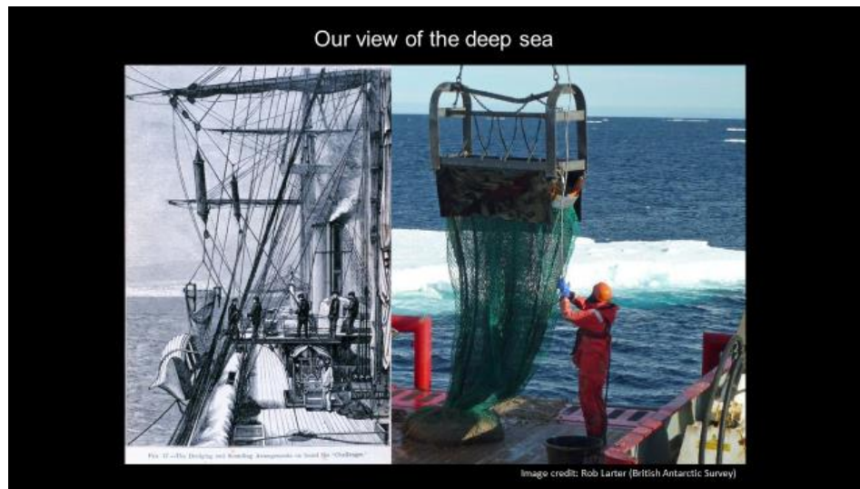
Figure 1: Comparison on modern vs historical sampling equipment showing very little has changed in 150 years.

This type of sampling, as well as depth soundings, and use of thermometers and other physical sampling tools, has taught us a lot about the deep sea. We know that pressure increases by one atmosphere every 10 meters. We know that light decreases with depth, such that, at around 200 meters, there is generally not enough light for photosynthesis anymore e.g. no plant or algal life. By about 1000 meters, there's no sunlight at all. We enter a world that is completely dark, save for that very beautiful light created by animals, called bioluminescence. We know that temperature decreases with depth. Surface waters maybe 10-15 degrees C or so around the UK, and warmer around the tropics, but as you go down through the water column, the temperature decreases. By about 1000 meters, it's only about four degrees C. That's the same temperature as your fridge. By the time you get down onto the abyssal plain at 4-5km deep, the temperature is around one degree C. So, the deep-sea environment is dark, it's cold, and the pressure is immense, much more than a human can stand.