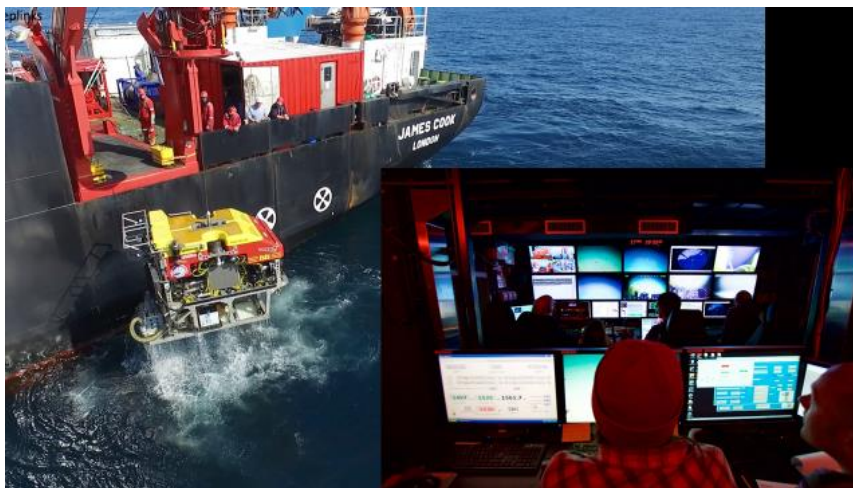
Figure 3: The UK's national ROV Isis being deployed from a large research vessel. Inset view from the back of the ROV control room.

Camera technology has now come of age and coupled with developments in robotic technology, is now enabling us to explore the deep sea in new and previously unimaginable ways. Fig. 3 shows an example of a large robotic vehicle, or remotely operated vehicle (ROV) being deployed from large research vessel. The accompanying image shows the view inside the vehicle control room. There are three pilots who sit at the front of the control room, drive the vehicle and operate the arms. Behind there is another set of screens where three scientists sit instructing the pilots on science operations and documenting observations. ROVs allow us to observe important and sensitive habitats like cold water coral reef, which themselves form habitat for other species like crabs and fish. Their manipulative abilities enable us to carefully collect samples from which we can learn more about the animals. However, collection of samples is time consuming and takes all three pilots. One on each arm and one driving the vehicle. It is technically very challenging, and the pilots are highly skilled. Better manipulative capability also facilitates the possibility of in-situ experimentation and precise observation and measurement, for example holding a thermometer directly into a vent plume to get an accurate reading.