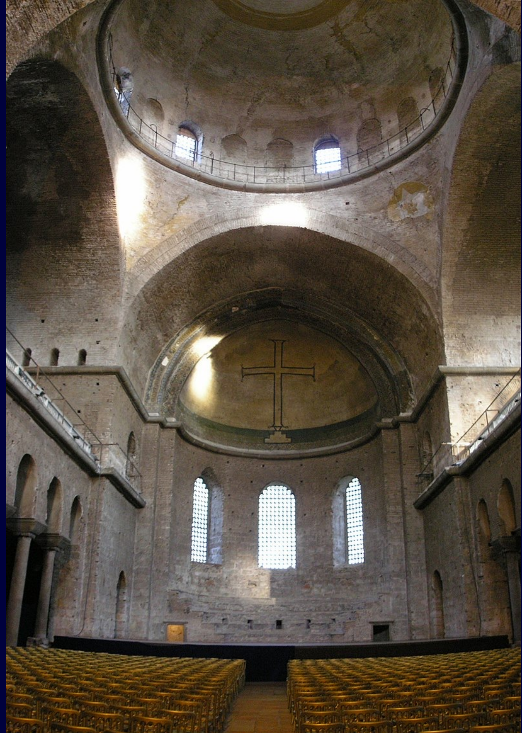
Hagia Eirene Constantinople, Mid 8 th century