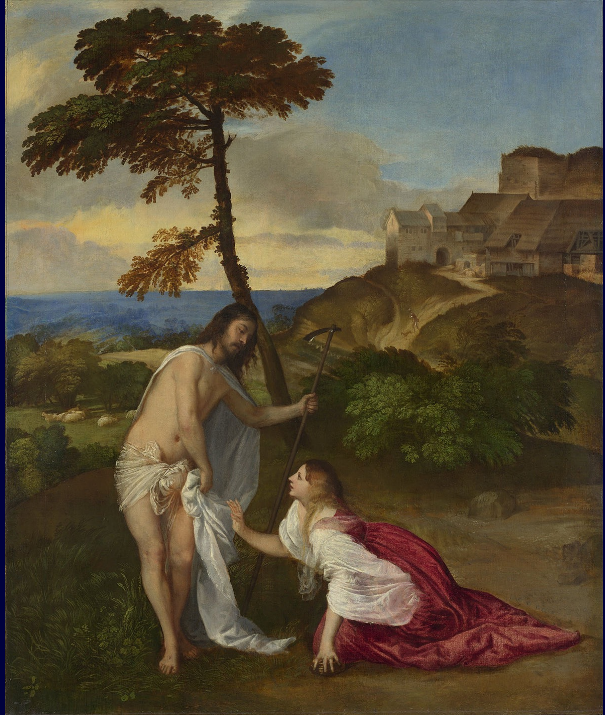
'Noli me tangere' Titian, 1490-1576 The National Gallery